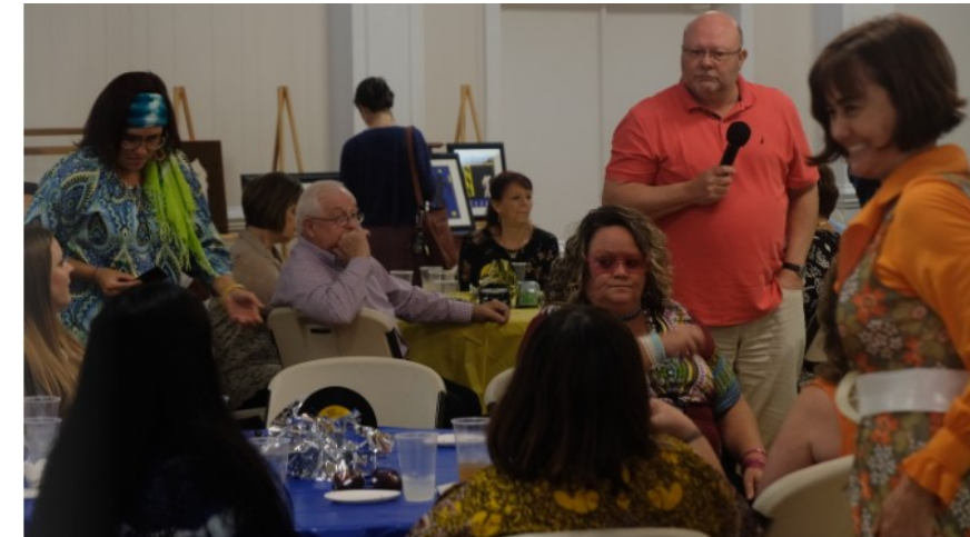
Everyone had a groovy time at the 1970's/1980's-themed Fundraising Benefit.

Yokefellow Prison Ministry Issue 09 Fall 2019