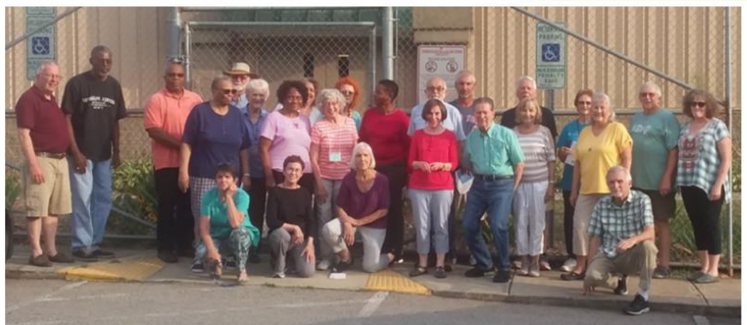
We love our Yokefellow volunteers at Orange Correctional!

Spotlight artwork courtesy of https://openclipart.org/detail/284958/theater-or-studio-spotlight-on-roof-mount