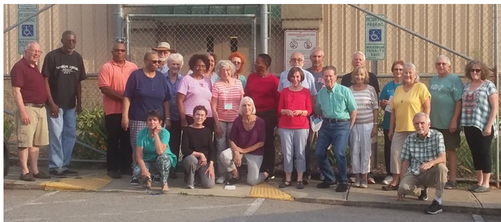
We love our Yokefellow volunteers at Orange Correctional!

Spotlight artwork courtesy of https://openclipart.org/detail/284958/theater-or-studio-spotlight-on-roof-mount