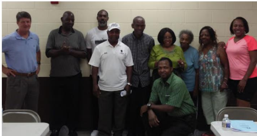
Post-incarceration ministry volunteers from the August 30, 2018 launch.

QUARTERLY NEWSLETTER OF YOKEFELLOW PRISON MINISTRY