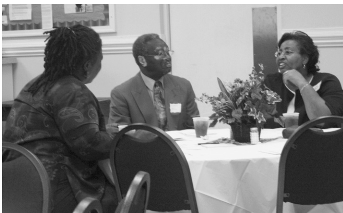
VOLUNTEERS ENJOYED FELLOWSHIP AROUND TABLES.