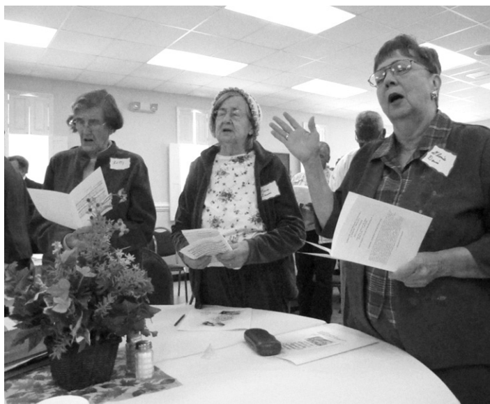
PARTICIPANTS ENJOYED TIMES OF SINGING.